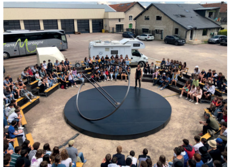
Example with bleachers provided by the organiser